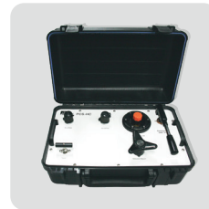
Portable Hydraulic Pressure Generator / controller (Model : PCS-HC)