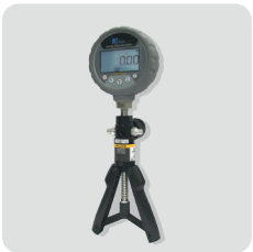
Pneumatic Hand Pump (Model : 700PTP-1)