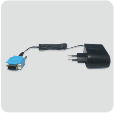
External Power Adaptor