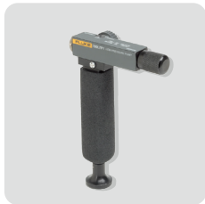
Low Pressure Hand Pump (Model : 700LTP-1)