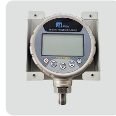
Panel Mounted Bracket