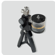
Hydraulic Hand Pump (Model : 700HTP-2)