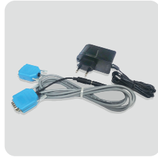
RS232C + Power Adaptor (RS232 Only)