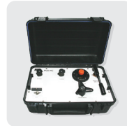
Portable Hydraulic Pressure Generator / controller (Model : PCS-HC)