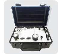
Portable Pneumatic Pressure Generator / controller (Model : PCS-PC)