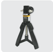
Pneumatic Hand Pump (Model : 700PTP-1)