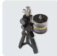
Hydraulic Hand Pump (Model : 700HTP-2)