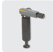
Low Pressure Hand Pump (Model : 700LTP-1)